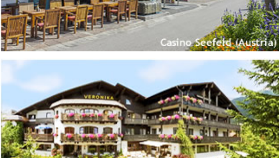
Hotel Veronika, Seefeld (Austria)