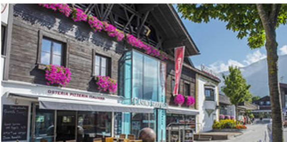
Casino Seefeld (Austria)

Play at the XVII Austrian Backgammon Open, Austrian Doubles Championship & 27th Italian Backgammon Championship it's the best way to spend the second week-end of October in one of the most classic mountain resorts in Austria! The Hotel Veronika is waiting for you. See how beautiful it is at www.aktivhotel-veronika.at Book your room now sending an email to veronika@seefeld.at More info: www.wbf.net