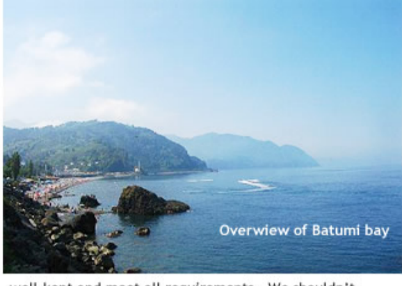
Overview of Batumi bay

In particular Batumi, which is the main Georgian resort on the Black Sea and has an international airport, is being rapidly transformed into the Monte-Carlo of the Black Sea. Situated in the Southern region of Ajara, close to the border with Turkey, Batumi has some major hotels such as the Hotel Sheraton and the Hotel Radisson, and shortly an impressive Hotel Kempinski, a Holiday Inn and a Hilton will open. Construction has begun on the Batumi Trump Tower, which will dominate the city. There are currently five casinos but other gaming companies are planning their entry into the area. During my visit to Georgia in May, I was able to verify the quality of hotel facilities: I stayed at Hotel Oasis in Chakvi, 15 minutes from Batumi, where the Georgian Backgammon Championship will be hosted and where players will receive a 15% discount on the normal rates. It is a very comfortable hotel, surrounded by a eucalyptus forest and has Hyatt style furnishings. The leisure facilities by the sea are especially