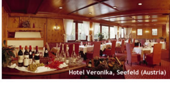
Hotel Veronika, Seefeld (Austria)